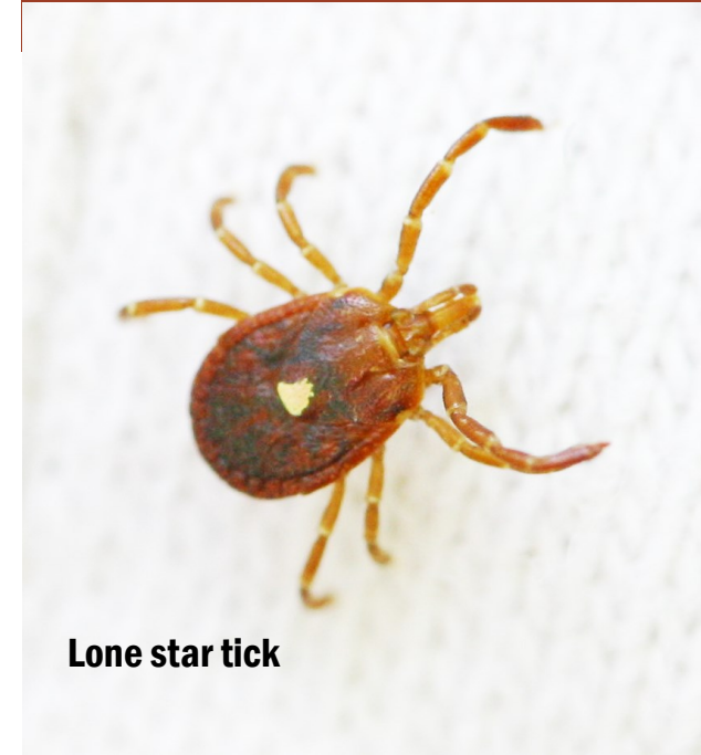
Lone star tick

Pesticide Applicator CEU's and Training Thursday November 8, 2018